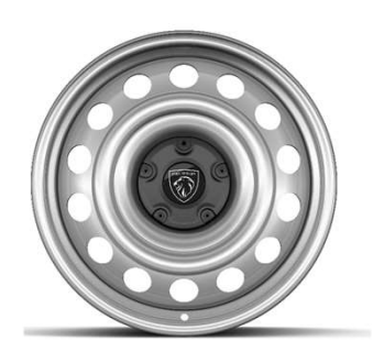
15/16" Steel Wheels 15" Std L1 16" Std L2